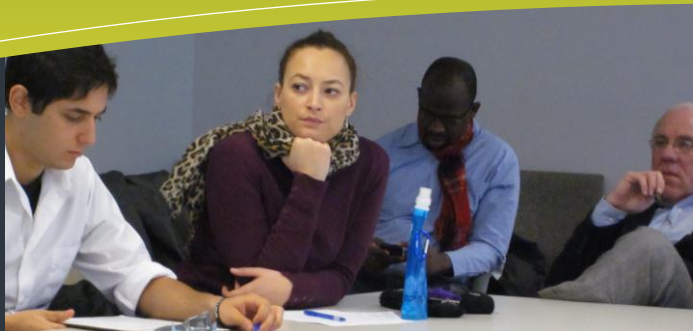
Pictured to the left: SIBD Members